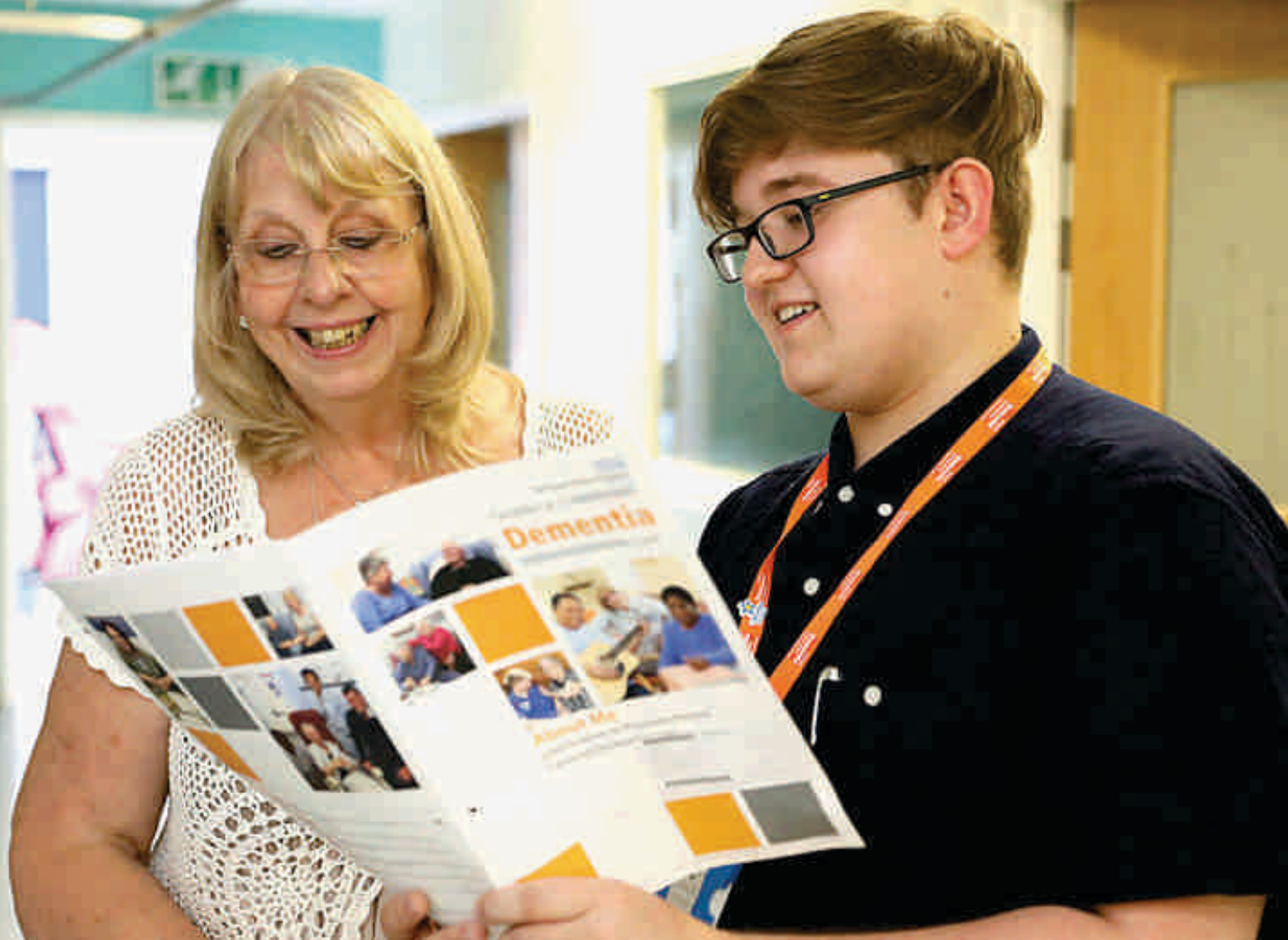
Dementia Outreach volunteer (right) at Royal Wolverhampton Hospital with a family carer

“The Dementia-Friendly Hospitals Charter is an important initiative to improve the care patients with dementia receive and ensure carers and families are involved every step of the way. I want every single hospital to commit to becoming dementia-friendly.”