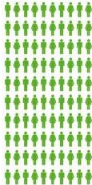
1,000,000 people with dementia in 2021