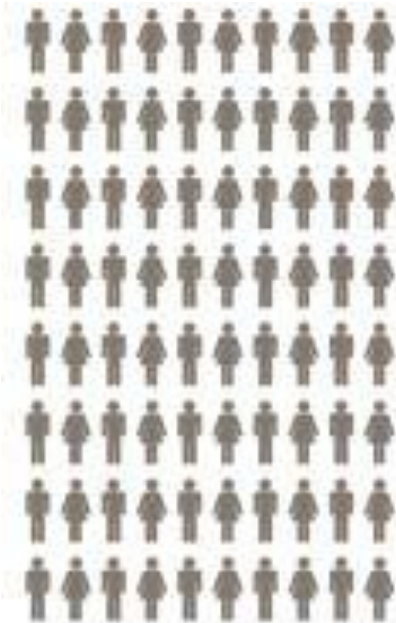
800,000 people with dementia in 2012